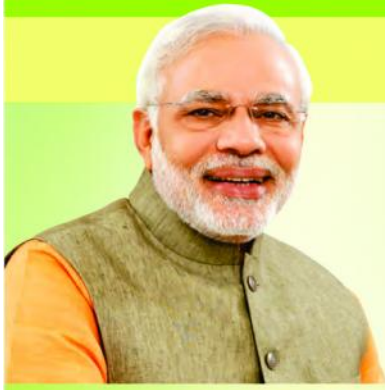
Narendra Modi Prime Minister