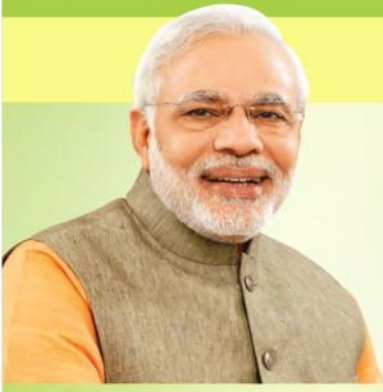
नरेन्द्र मोदी प्रधानमंत्री